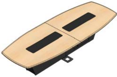
Code T526 FTF 526FR + 36BS4FR + 526FR